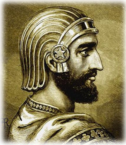
KING OF PERSIA (559-530 B.C.)

This Persian emperor was actually prophesied about by name in Scripture, over one hundred years before he was born! Check it out for yourself. Isaiah 44:28 gives the Word of the LORD: “Who says of Cyrus, He is my shepherd, and he shall perform all my pleasure, saying to Jerusalem, ‘You shall be built,’ and to the temple, ‘Your foundation shall be laid.’” (8 th Century B.C.)